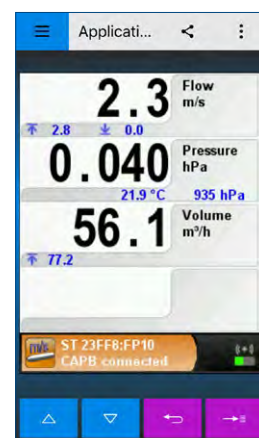
Example for measurement on EuroSoft live app

Range: -20 ... +20 hPa, 0.2 ... 20 m/s, -50 ... +600 °C