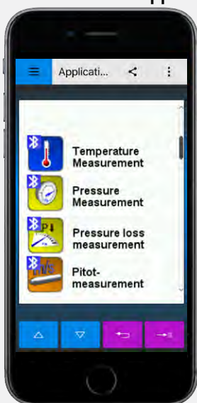
Example on your Smartphone