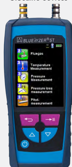
Example on our BLUELYZER ® ST